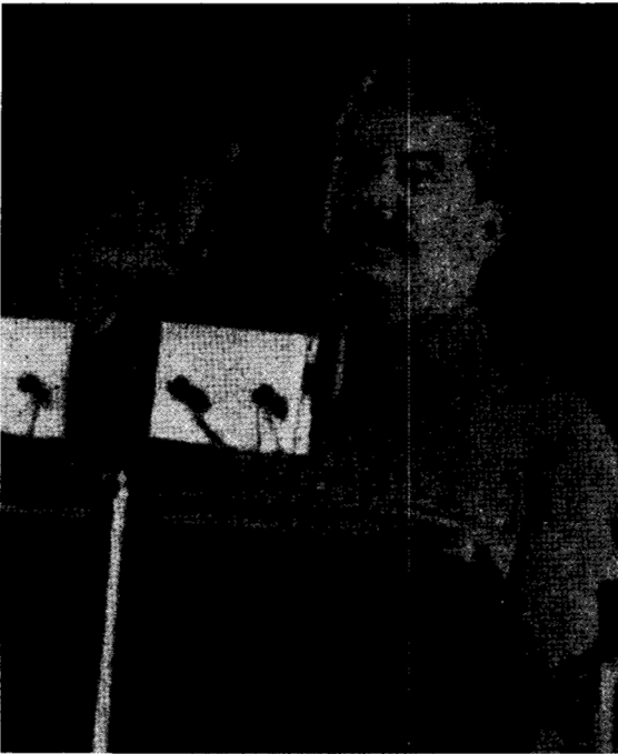
Sovfoto picture of Stalin published in "Building America Series."

Children of the seventh and eighth grades are at an impressionable age. Pictures leave a lasting impression that can seldom be effaced by words.