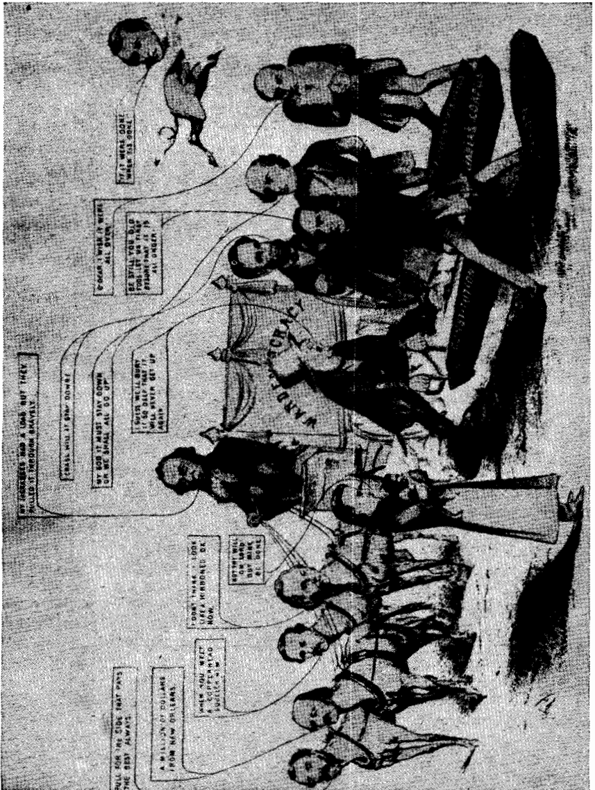
(26) The cartoon above shows Lincoln, Sumner, and Greeley burying the Constitution, Free Speech, the Habeas Corpus and the Union. It illustrates the criticism the President was subjected to when he issued a proclamation early in the Civil War, directing trial by courts-martial or military commissions of all persons who impeded the draft, discouraged enlistments or committed other disloyal acts. In justifying his suspension of certain civil liberties in wartime, Lincoln answered his critics by saying: "Must I shoot a simple-minded boy who deserts, while I must not touch a hair of a wily agitator who induces him to desert?"

Along with this textual comment on Lincoln there is printed on page 243 of Building America the only picture of our martyred President who preserved our Union. (Reproduced herewith.) It is a cartoon presumably the work of Lincoln's enemies. These enemies are not held in