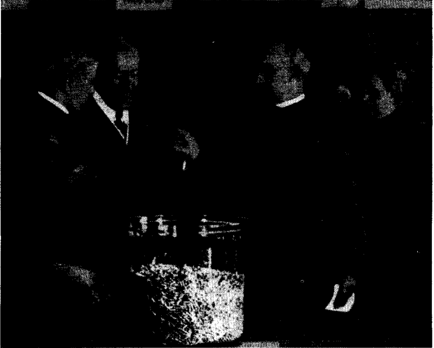
(39) Above, President Wilson is choosing the first draft numbers to be called in World War I. Although the Constitution prohibited "involuntary servitude," the draft laws were upheld by the courts.

From my recollection of these publications, there were too many "hard-times" pictures credited to the Farm Security Administration. That agency should have few left for future publications. But that agency