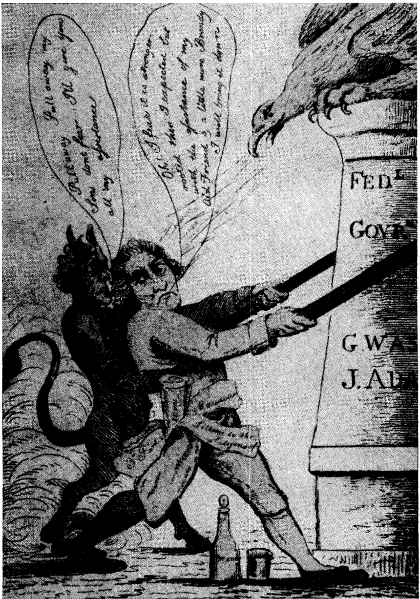
(23) This cartoon of 1801, entitled "Mad Tom in a Rage," is a Federalist view of Thomas Jefferson's belief that the central government was assuming too much authority. It shows President Jefferson pulling down the Federal government with the help of his "friends," the devil. Such a portrayal of the President would offend public taste today, but it was in the spirit of the bitter party warfare of its times. Thomas Jefferson thought that the Constitution gave very little power to the Federal government and left most matters to the states to control. Under Washington and Adams (Federalist presidents) the Federal government had taken many steps which opponents like Jefferson claimed went beyond the powers granted to it by the Constitution. It had suppressed local rebellions and established the credit of the United States by vigorous measures. It had passed Alien and Sedition laws which punished those who criticized the government, though this was in violation of the freedom of speech guaranteed by the Bill of Rights. But before Jefferson's term of office was over, he went beyond the powers specifically stated in the Constitution, too. For example, he purchased the Louisiana Territory.