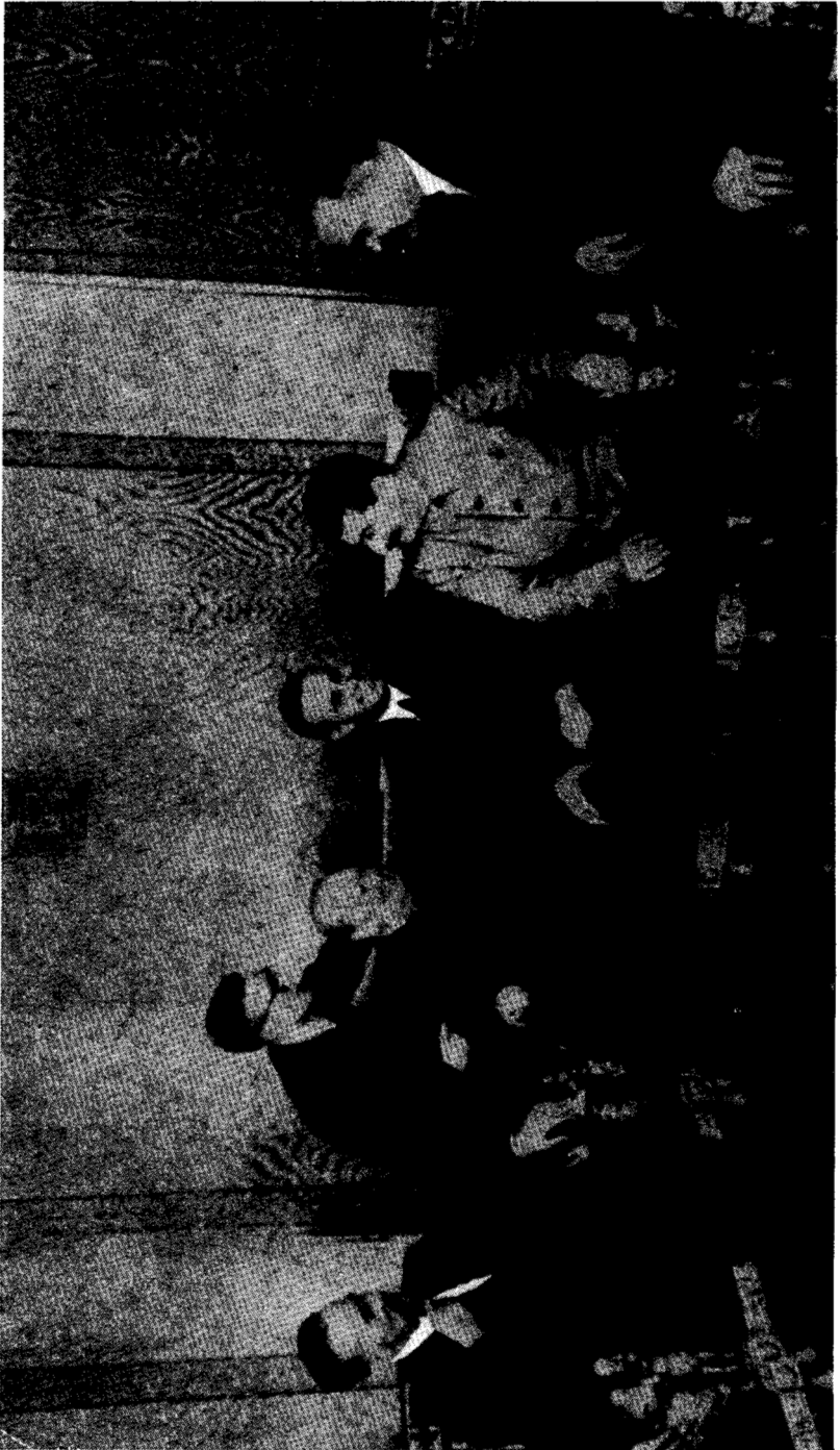
(52) For "frank and friendly" discussions about the war and the peace, representatives of "The Big Three" have had frequent meetings. Shown here are Prime Minister Churchill, Ambassador Harriman, Marshal Stalin, meeting in Russia in 1944.

The committee notes that Stalin is the center of attraction in this photograph published in the "Building America Series," in marked contrast with Lincoln and Jefferson cartoons.