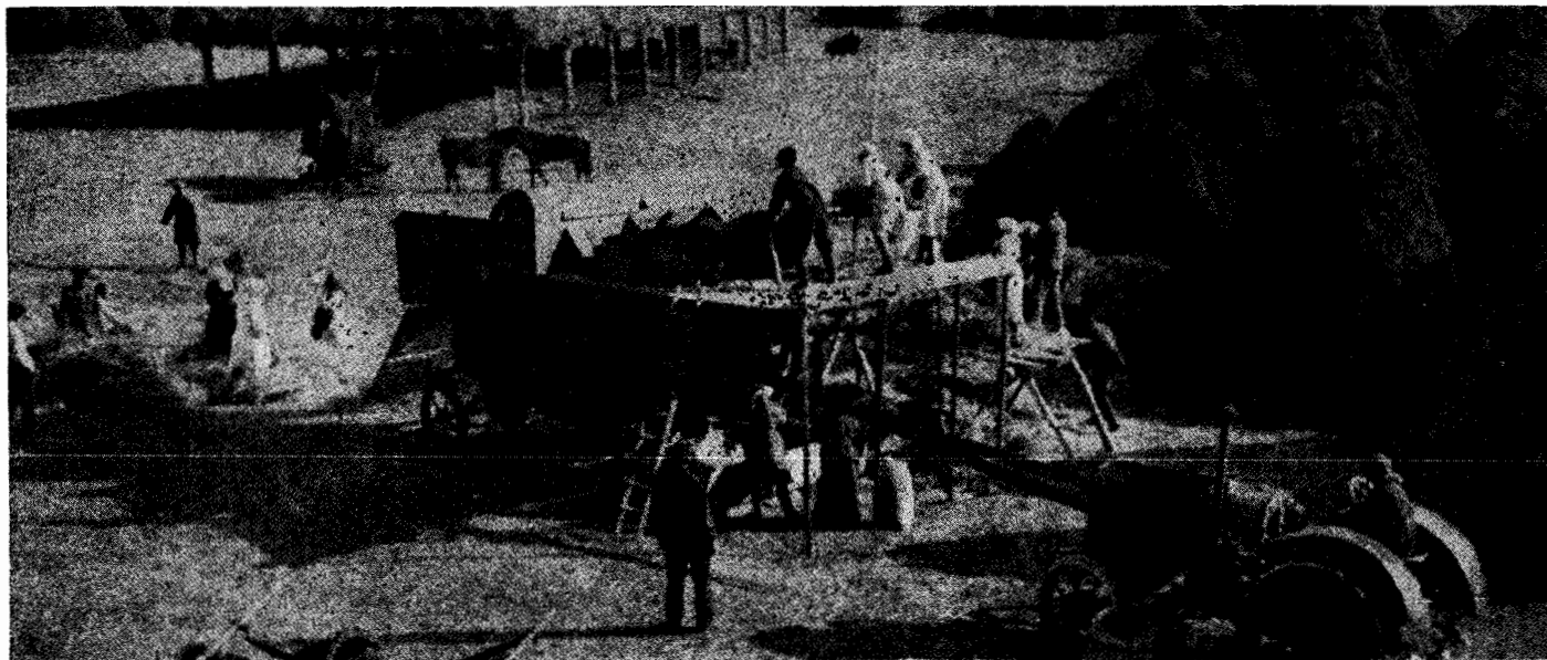
(33) Threshing wheat on a collective farm. Except for a small plot reserved for the farmer's own family, the land is used by all the members together. By having big, instead of small, farms a great deal of machinery can be used. Some of this is bought by the farm and some is rented from Government Machine and Tractor Stations. Contrast this picture and caption from the "Russia" volume of a prosperous scene on a Russian "Collective Farm" with the American farm scene on the preceding page which appears in the "Seeing America" volume.