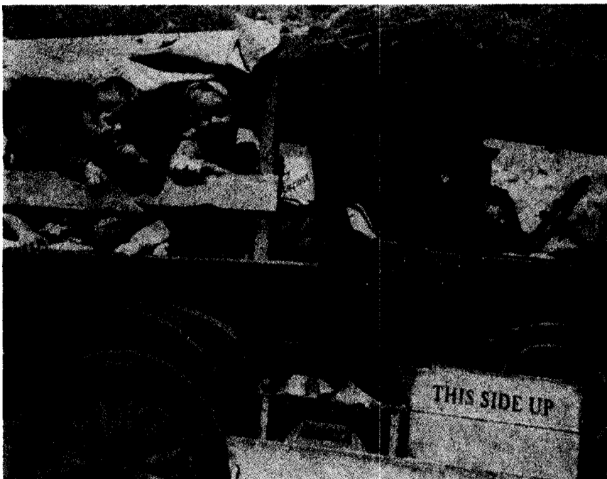
A family of refugees from a drought area. When droughts come and cattle and vegetation die, some farming people who are poor leave their farms and become tenants or sharecroppers. (From "Seeing America.")