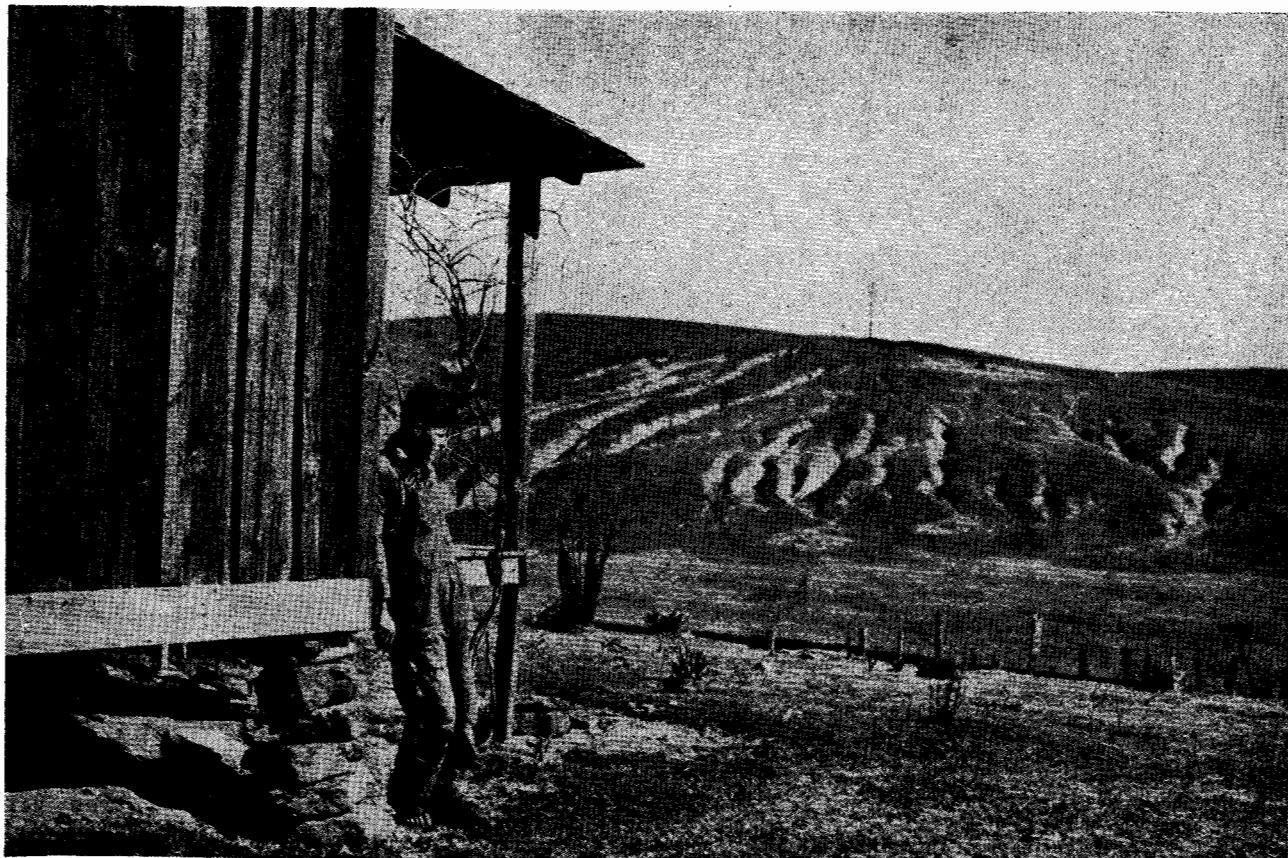
A young farmer looks thoughtfully over his land which gets poorer and poorer each year as the rains wash down the gullies, widening them, and carrying more good topsoil as they go.